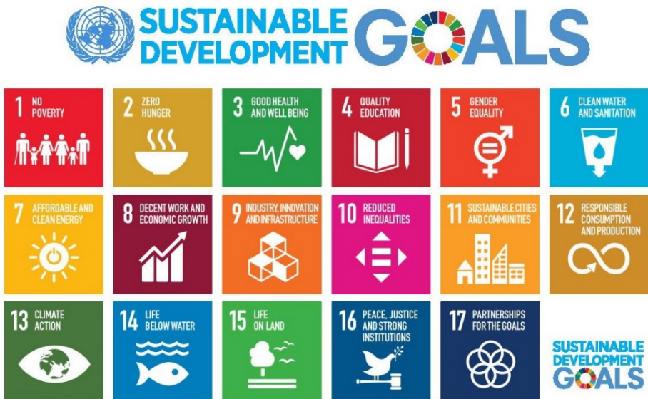
Fig. 1. Sustainable Development Goals [7]

One of elements in addressing these challenges is the crucial role played by universities worldwide. Universities have the potential to serve as centers of innovation, knowledge, and advocacy in the effort to achieve sustainable development [12-13]. Universities possess the capacity to generate in-depth and relevant scientific research in various fields related to sustainability, from environmental science to social economics [14]. Moreover, universities also play a role in educating future generations, who will be the leaders of tomorrow in the pursuit of sustainable development goals [15-16]. Integrated sustainability education in university curricula offers opportunities for students to comprehend the complexities of sustainability issues, develop critical thinking skills, and ignite their leadership spirit [17]. Universities can also serve as role models in implementing sustainable practices on their campuses, inspiring positive actions in society. Universities can become influential agents of change by bridging the academic world with the private sector, government, and civil society organizations [18]. Collaboration between universities and external parties can facilitate the transfer of knowledge, technology, and best practices that support sustainable development [19]. Hence, universities have a significant responsibility in establishing and maintaining broad and synergistic networks to achieve sustainability goals more effectively.