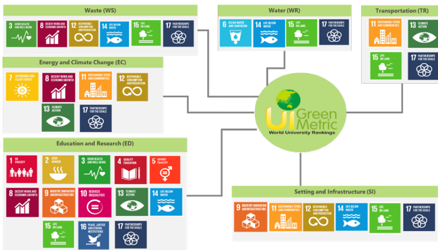
Fig. 2. UI GreenMetric and SDGs [22]

The number of sustainability-related publications in the last three years is one of the UI GreenMetric indicators. Scientific publications related to sustainability constitute one crucial way in which universities can make substantial contributions to supporting sustainability issues. Universities often serve as hubs for scientific research and development, granting them access to in-depth knowledge across various aspects of sustainability [20]. Research and publications in the field of sustainability encompass diverse topics, ranging from climate change and renewable energy to environmental sustainability, food security, and social innovation [21]. These publications can furnish a robust scientific foundation for more effective policymaking and assist in addressing complex sustainability challenges. This paper discusses how UI GreenMetric and sustainability publications interact to strengthen universities' contributions to global sustainability.