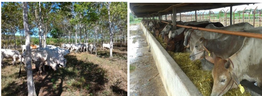
Fig. 1. Integrated and Feedlot Program [11]