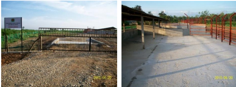
Fig. 2. KLPK Quarantine Facility [11]

The company's commitment to cattle rearing and breeding is proved by its ability to provide mass production for the internal market. However, the company's future direction intends to produce its cross-breed herd with extension in quality and specific valuation; even though no new breed was produced in the last five years after the introduction and innovation of artificial intelligence in Selembu dan Brangus breeds [13]. The list of the KLPK Ternak Sdn Bhd herds product as Figure 2.