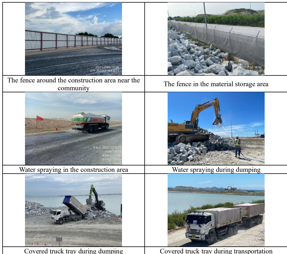
Table 1. Selected photos of land-based environmental mitigation measures being complied