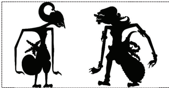
Figure 3. Arjuna and Cakil puppet modeling (source: personal document)

motion of the "Perang Kembang" scene into silhouette animation.