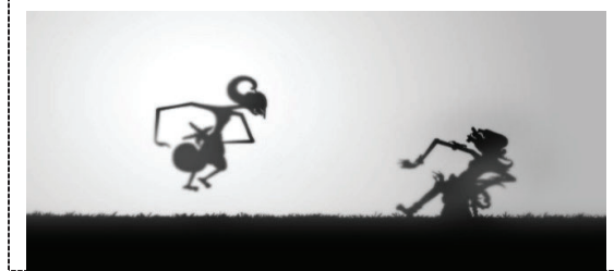
Figure 6b. Arjuna's war scene jumps to attack Cakil who is tackled (nggeblak)