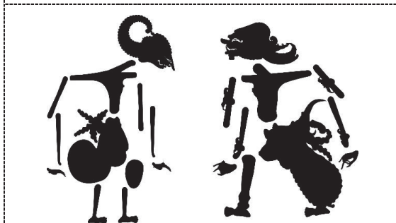
Figure 4. Cutting for puppet joints (source: personal document)