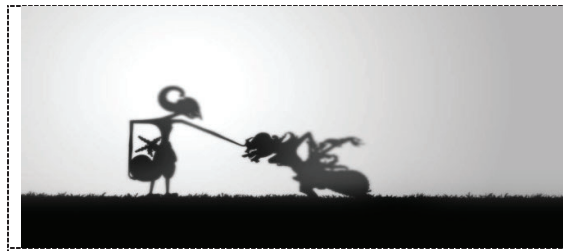
Figure 6a. Arjuna's war scenes holding back Cakil's attack with his head (bumping)

The following is an example of silhouette animated sequence images based on the shadow motion of the puppet scene "Perang Kembang".