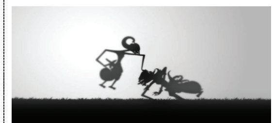
Figure 6c. Arjuna War Scene Throws Cakil's head to the ground (njeblos)