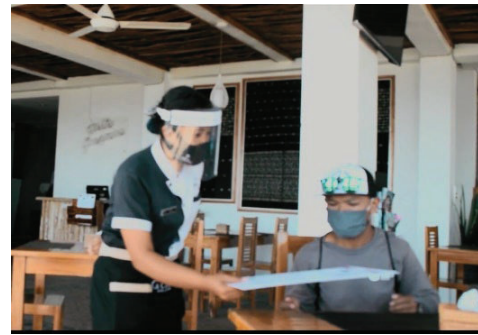
Fig. 2. Waitress in La Cecile Hotel & Café Labuan Bajo