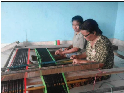
Fig. 1. Home Weavers for Souvenirs in Labuan Bajo

be involved more deeply and deeply in their role as professional workers in the tourism sector, they faced a dilemma with their duties as a (prospective) wife and mother who had to serve the family. The task is an obligation that cannot be avoided and handed over to others. He will then feel guilty if he neglects this main task. This cultural image of women limits their access to public spaces and participation in development. This is an internal factor that comes from the women themselves. On the other hand, external factors emerge from society's view of women (subordination), namely as a second-class society who continues to carry out their obligations as family servants. 84% of female respondents do domestic work (taking care of family members/children, cleaning the house, cooking, fetching clean water, taking care of livestock, and washing) although the average working time is 5-10 hours a day.