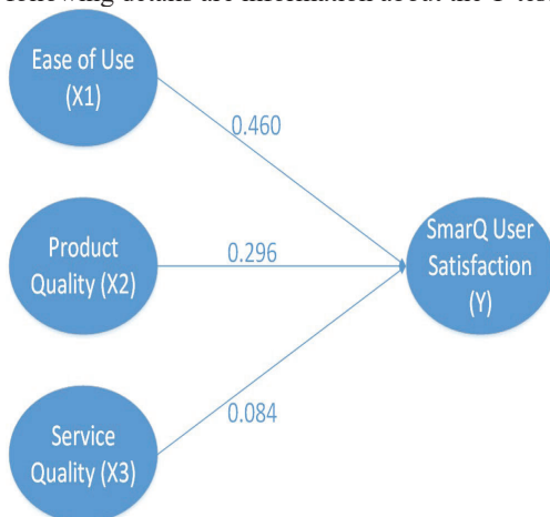
Fig. 2. The variation shapes.

Further hypothesis test was conducted in the form of a t-test and F test. The following results were obtained in Table 2 and Table 3. Based on the simultaneous F test results, it can be seen that the calculated F value is 80.2 > 2.83 . The value shows that it is accepted, which concluded that ease of use (X1), product quality (X2), and service quality (X3) have a simultaneous and significant effect on partner user satisfaction (Y). The following details are information about the T-test.