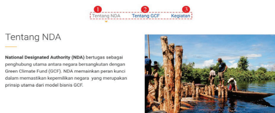
Fig. 3. “Tentang NDA” (About NDA) segment.

Another important segment of the information presented in a website is about the credibility of the institution, generally given a label as “ Tentang Kami ” (About Us), in this case the name is “ Tentang NDA ” (About NDA) shown in figure 3. In the “About NDA” segment, it looks like the visual wants to present a choice of several sub-segments, this can be seen by the 3 information texts placed at the top middle. If these 3 sub-segments are selected, they will be the titles presented in the text box to the left of the layout.