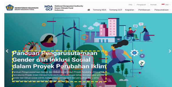
Fig. 2. Main banner of NDA GCF website

Important information is presented visually in a fairly large size scale in a main banner as shown in figure 2. The main banner can contain some information which becomes a snippet of some important information depending on the situation and the momentum of the user accessing a website. In the NDA GCF website, the user can see that one of the first pieces of information that appears when you enter the website page is the arrangement of illustrations and text boxes. The illustrations presented show the atmosphere of human life from the natural aspect, humans who are interacting and some forms of renewable energy sources are seen. If examined from the presentation of the text content, this main banner wants to visually convey actions related to gender and social inclusion in climate change projects.