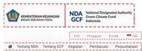
Fig. 1. NDA GCF Header

Starting from the aspect of organizing information in the header section, the emergence of a visual identity that is present on a fairly large scale compared to the header area ratio, makes that identity easily visible first in the visual navigation flow hierarchy. Arrangement of other information in the middle to the right is seen that some information will be better if given a clearer grouping of information or in design principles of gestalt is called similarity [14]. The placement of the buttons in the form of text on the right, even though the position is divided into 2 alignments above and below, but the visual elements used still look similar because lack of contrast. Typographic as visual elements are given the use of color elements that are less contrast, light gray and dark gray. There are also attempts to differentiate from the aspect of scale, but the scale presented is also not significant enough to differentiate the two groups of information (figure 1), this can cause the user to find navigate the website more difficult [7].