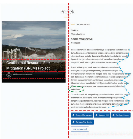
Fig. 4. “Proyek” (projects) segment with visual markings.

The visual element of concern is the processing of the 3 texts above shown in red bullets “ Tentang NDA ” (About NDA), “ Tentang GCF ” (About GCF) and “ Kegiatan ” (Activity) which turns out to be a button. In its function as a button to open or display more information, placing text as a button will be more optimal if it is visually given a unique visual treatment that can show that the three texts are not ordinary text. In terms of the placement of elements and navigation, which means that after the 3 buttons, a larger title appears, coupled with the use of blue elements that are different from ordinary text, helping users to guess about the function of the 3 words at the top. Another suggestion is that if the three pieces of information are really important, then it's better if the three pieces of information are presented entirely in a trigger portion which, if the user is interested, can explore further.