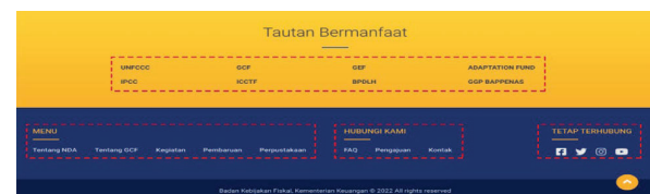
Fig. 5. Footer design

From the previous several segments, this section shows that the information to be presented is quite complex, here the users see several types of information that have also been carried out with different visual touches to be able to show the existence of different information. Some things to note to make it better is one of them by placing the typographical visual element of the title of the article combined with photography on the left side of the layout, then the translation of information through text on the right side, it looks like there are 2 separate parts of information. Processing the layout of the text box on the right side can pay more attention to the blue dotted line, text fragments can be made to tend to be more even so that eye navigation when reading becomes more consistent. Notes on the paragraph is about the appearance of orphan that should be avoided, a word that hangs alone within paragraph, marked above with a green dotted line. The paragraphs end sentences also formed too extreme end points that shows jagged edges along the right side of the text paragraph, this shown in the blue dotted lines. At the bottom of the text on the right side, the user can see a row of blue buttons that show several buttons that have different functions but are presented with the same visual treatment, as if they have the same function.