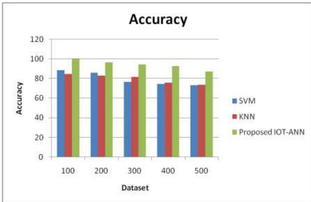
Figure 2. Comparison chart of Accuracy

The Figure 2 Shows the comparison chart of Accuracy demonstrates the existing SVM, KNN and proposed EM-ANN. X axis denote the Dataset and y axis denotes the Accuracy ratio. The proposed EM-ANN values are better than the existing algorithm. The existing algorithm values start from 72.94 to 88.12, 73.72 to 84.37 and proposed EM-ANN values starts from 86.87 to 99.67. The proposed method provides the great results.