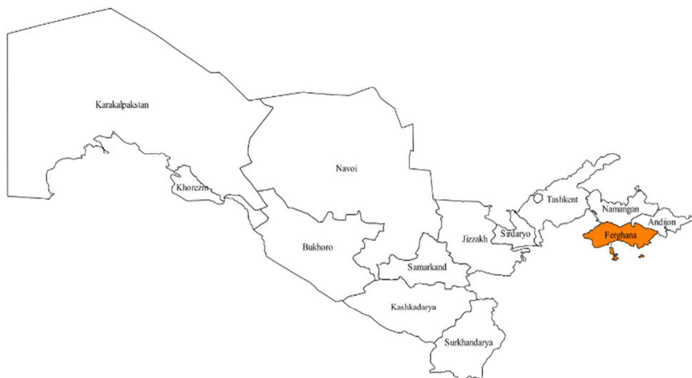
Fig. 1. Map of the study area, Fergana province.

Fergana province is one of the provinces of Uzbekistan, located in the southern part of the Fergana Valley in the far east of the country. It borders the Namangan and Andijan Regions of Uzbekistan, as well as Kyrgyzstan (Batken and Osh Regions) and Tajikistan (Sughd Region). Its capital is the city of Fergana. It covers an area of 6,760 km 2 . The population is approximately 3,896,395 as of 2022, with 44% of the population living in rural areas (Figure 1.)