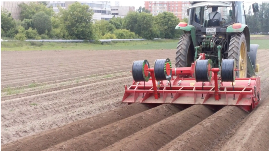
Fig. 3. Drip Tape Installer Based on Ridge Shaper Grimme GF-75/4.

After analysis of the obtained results in the course of laboratory studies, it was found that the working equipment can be installed on the Grimme GF-75/4 ridge former, which will allow combining technological operations for the formation of ridges and laying the drip tape (Figure 3). The formation of ridges is carried out on the 10-14th day after planting, at this time the plant has enough moisture reserves of the mother tuber, so additional watering is not required.