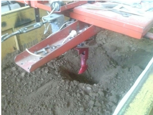
Fig. 1. Laboratory studies of the drip tape installation process.

To confirm the theoretical dependencies, laboratory studies were carried out with a model of a drip tape stacker on a soil channel. In the course of the study, the numerical values of the resistances were determined, which arise in the process of unwinding the drip tape coil, pulling the tape through the pipe and placing it in the soil (Figure 1).