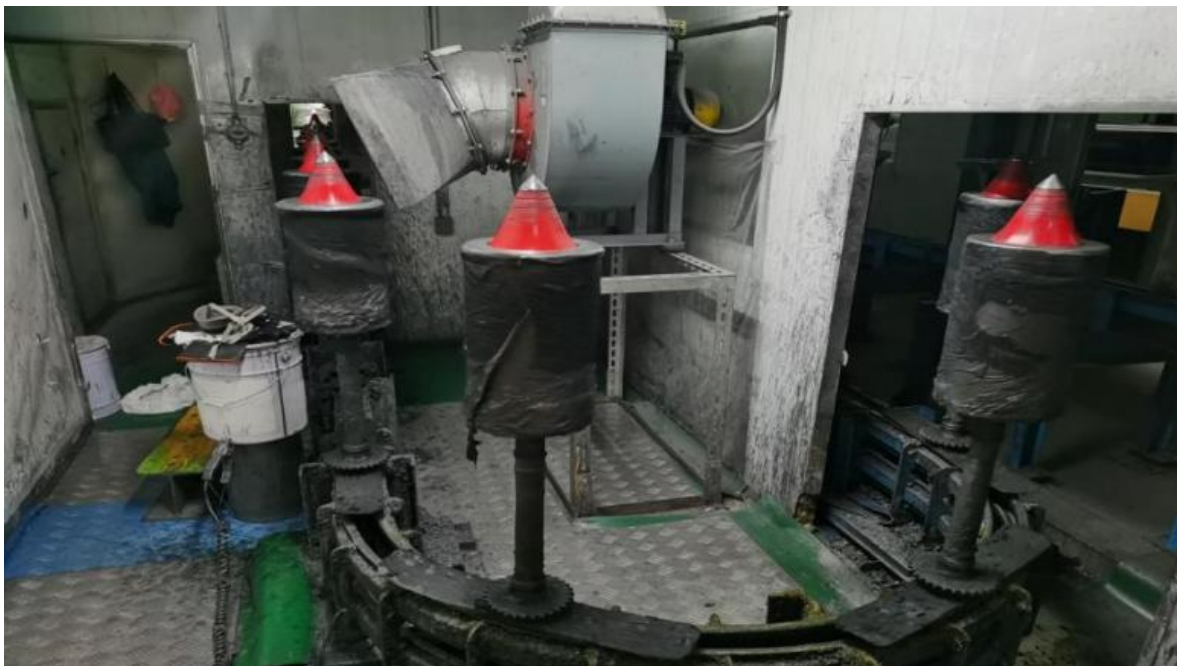
Figure 2 Hub fixture diagram to be cleaned