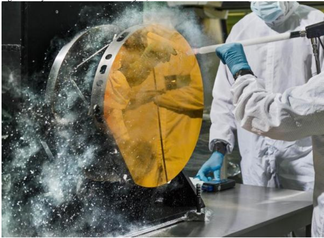
Figure 1 Dry ice cleaning diagram

will not cause any damage to the surface of the object being cleaned, especially the metal surface, and will not affect the finish of the metal surface. Figure 1 shows the dry ice cleaning diagram: