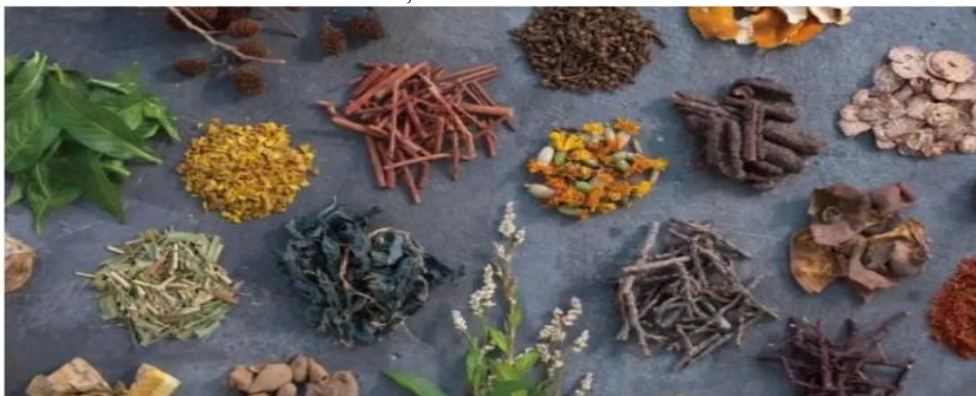
Fig.1 Some vegetable dyes

the improvement of people's awareness of social environmental protection, plant dyes have attracted more and more attention [1] . In addition, plant dyes have many functions, such as antibacterial [2] , in addition to dyeing properties. In this paper, the classification, identification, application and existing problems of vegetable dyes are reviewed.