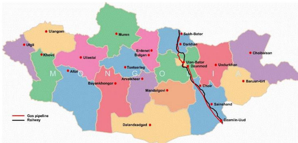
Fig. 4. Route of Power of Siberia 2 gas pipeline in Mongolia.