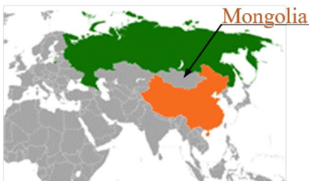
Fig.1. Geographical location of Mongolia.

Mongolia is one of the NEA countries and is located in the very heart of the Asian continent and has a number of specific features that distinguish it from the other countries in the region. The main one is the geographical location, which is shown in Fig. 1.