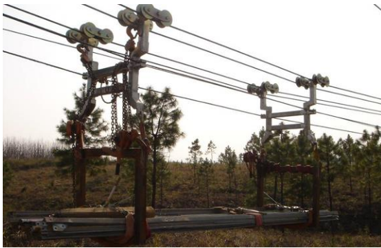
(a) Heavy cargo ropeway

② Adopting the technology of horizontal arm holding pole and tower crane, avoiding the disturbance of the inner suspension and outer holding pole, reducing the area of each base iron tower by 1600 square meters