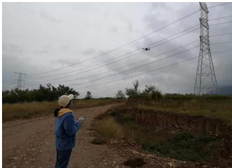
Fig.5 Construction control measures