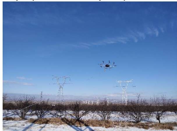
(b) Drone wire

Fig. 3 shows the working status of heavy cargo ropeway and uavs on site respectively.