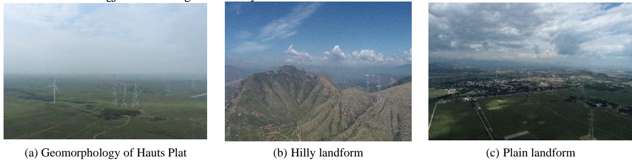
Fig.2 Geomorphologic types along the project line

Zhangbei-xiongan high-pressure project spans a long region, involving Zhangbeiba Hauts Plat., hilly and plain three types of landforms. As shown in Fig. 2, the elevation along the line is between 42m and 2100m, and the overall trend is high in the north and low in the south. The climate types of the project area are mainly temperate continental climate and warm temperate semi-humid semi-arid continental monsoon.