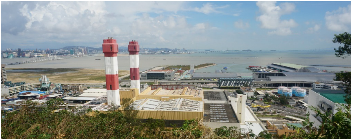
Fig. 1. Overlooking the Macau Waste Incineration Center from Taipa Mountain in Taipa (Image source: Photographed by the author).