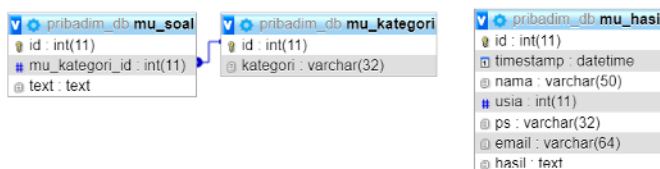
Fig. 2. Designing table in application database.

After through the planning stage, the next stage is designing. Designing here is include input design, process, output, and interface. The database design is shown in Figure 2.