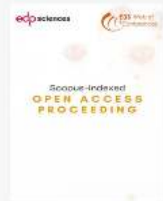
E3S Web of Conferences