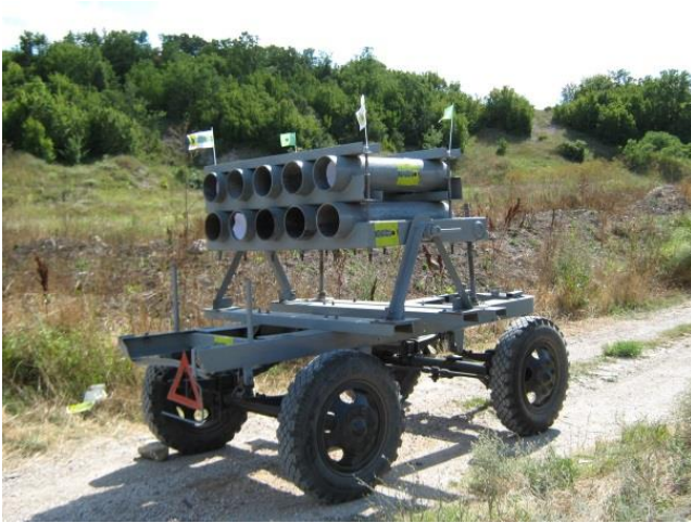
Fig. 1. Multi-barrel module successfully tested to eliminate the consequences of the spill in the Kerch Strait (2007).