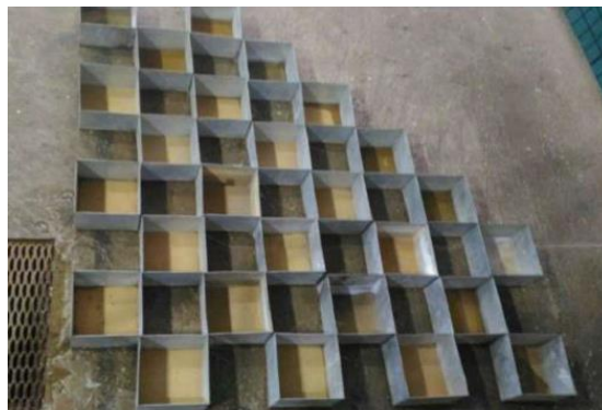
Fig. 3. Location of collection pans during tests.

During the tests, the sprinklers were installed at a height of 2.5 m from the top cut of the collection pans. One of the four 1,55 mm diameter holes in the sprayer was oriented diagonally to the square on which the pans were installed (Figure 3).