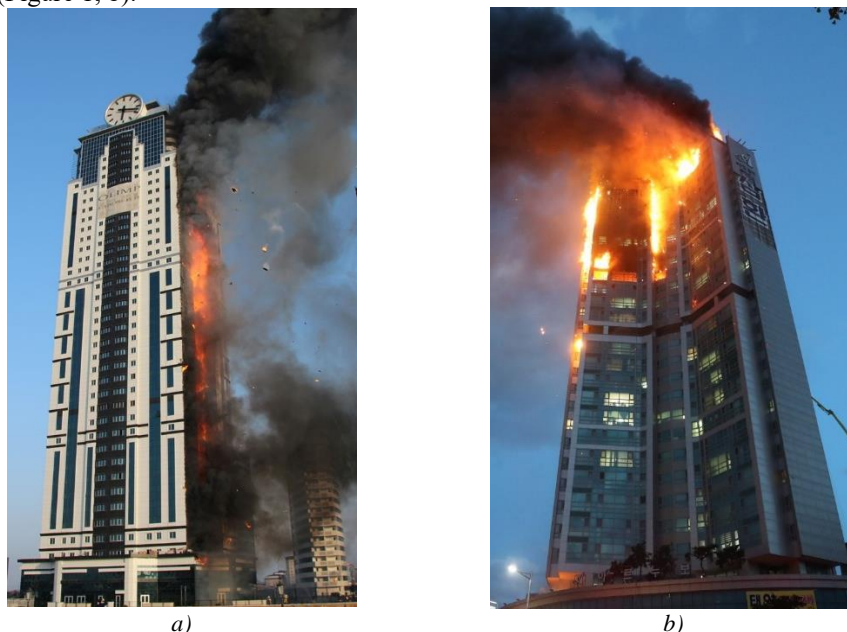
Fig. 1. Examples of fires in high-rise buildings: a) Grozny City; b) Ulsan in South Korea

The largest high-rise building fire in Russia took place in the city of Grozny in the Chechen Republic. In April 2013, the Olimp Tower in the Grozny City skyscraper complex caught fire (Figure 1, a). The flames engulfed the entire building, from the 2nd to the 40th floors. The fire was not extinguished until 7 hours after it started. This case also shows that Russia does not have enough special machinery and equipment to extinguish fires at such a height. Abroad, a similar fire occurred in a 33-storey skyscraper in South Korea in October 2020 (Figure 1, b).