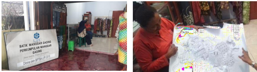
Fig. 4. Batik Center in Hamlet of Gading I, Gading Village, Playen District.

The batik motif developed is the Manggar motif based on the uniqueness of the Gading Village area, which has many flowering coconut trees (Manggar). But unfortunately, there is no Waste Treatment Plant (IPAL) in this batik village, so the waste is only dumped into a big enough hole made in the middle of their yard/garden,[3] then backfilled with soil when enough waste has been wasted disposed of. After that, it will move to make another hole that is still in the yard. So far, there has been no impact on the craftsmen or residents, but they hope to receive socialization and facilitation in managing the waste they produce.