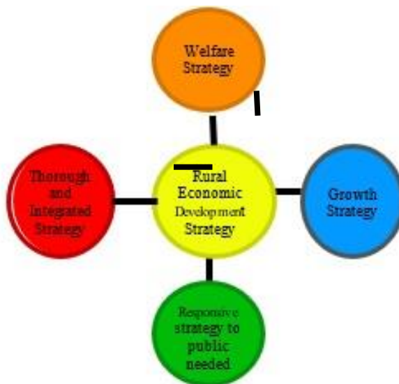
Fig 1. Village economic growth strategy.

Rural economic development is stated in Law Number 6 of 2014 concerning, village development, as defined in Article 78 paragraph (1), aims to increase the welfare of rural communities regarding human life quality, as well as poverty reduction, by meeting fundamental necessities, development of village facilities and infrastructure, development of economic potential local areas, as well as the sustainable use of natural resources and the environment[6]. In essence, village economic development has the principles of togetherness, kinship, and cooperation to realize the mainstreaming of peace and social justice. The village economic development strategy can be seen in the following figure;