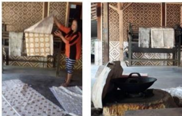
Fig. 2. Batik Center in Trembano Hamlet, Ds. Tegalrejo, Gedangsari District.

certified by the DIY Manpower Office. In addition, Gedangsari District already has a unique batik motif that has been patented, namely the Buron Wono motif for being the winner of the Gunungkidul Typical Batik Motif Design Competition in 2011. Tegalrejo Village, especially in Trembano Hamlet, is one of the areas that has a batik center in Gunungkidul[4]. Therefore, the local village government continues to focus on developing its batik natural colored. Thanks to the creations of these hundreds of artisans, batik from Tegalrejo is widely known. But the proudest thing is that this creation has its motive. The batik motifs owned include Ratuning Gedangsari I, Ratuning Gedangsari II, Pring Sedapur and Sekaring Gedangsari.