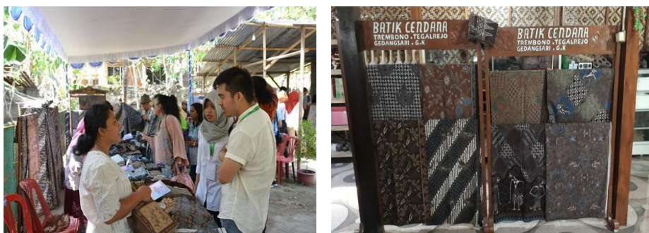
Fig.3. Hand-drawn Batik with Natural Colors and Expo at the JIBB event.

Tegalrejo village is located about 45 km north of the central government of Gunungkidul Regency, and it does have quite a lot of residents who work as batik. Road access to the location of the terrain is quite tricky because it is hilly and lacks markers such as gates, signposts, and placards with the name of the location. There you can see the batik activity of several artisans.