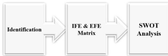
Fig. 2. Stages of Organic Rice Supply Chain Strategy

The first step is to identify the characteristics of potential rice products as organic rice products. Next, identify the actors in the rice supply chain at the Gatos organization and conduct a descriptive analysis of environmental conditions that affect organic rice production. The research was conducted at the center for producing organic rice products, Gatos (Sawangan Organic Farmers Association) in Sawangan village, Magelang district, Indonesia.