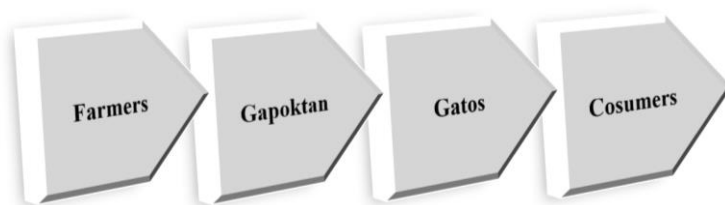
Fig. 3. Identification of organic rice supply chain in Sawangan

Farmers Association), and consumers. Each supply chain actor has its role. Farmers are actors who have a very important role, namely cultivating rice until it becomes ready-to-mill grain. Gapoktan has a role as an intermediary between farmers and Gatos who is a producer of organic rice.