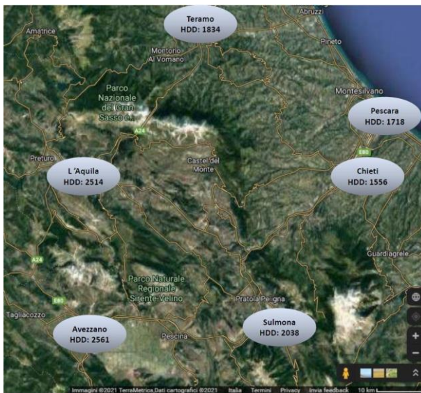
Fig. 2. Buildings’ location: the cities where the buildings are located are circled in gray (Authors’ elaboration from Google Maps).

The analyzed archetypes, built in different periods - from 1814 to 2000 - are characterized by different envelopes. Most of the buildings are made of masonry, even if reinforced concrete is frequently used. Except for three more recent university buildings in L’Aquila, all others were found to be without insulation. Table 1 summarizes the characteristics listed so far.