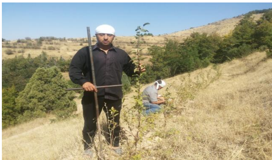
Fig. 2. The growth of Sievers apple tree seedlings in height after application of mineral fertilizers in a dose of N 120 P 180 K 90

At the apple-tree, the reaction was better at a large dose of fertilizer. At the same time, fertilizer ensured an increase in the annual growth of seedlings more than 8.1-9 cm than in other experiments. In this embodiment, sharp growth was observed already at the beginning of the vegetation - in the middle of May and throughout the growing season (Fig. 2).