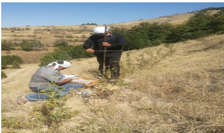
Fig.3. Determination of soil moisture on the western slope on variants with the use of mineral fertilizers

The humidity was studied in the middle of one of the surfaces at each version of the experiment on the cultures of the apple tree, as the most dynamically developing type (Fig.3).