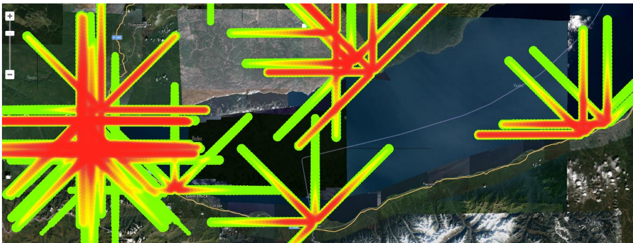
Fig. 4. Geovisualization of calculation results

On stage 2, we will calculate spreading of pollutants from energy facilities using results from the first step and weather data. Fig.4 shows spreading of pollutants in April 2021. The results being displayed are preliminary, because now, model does not account terrain which may lead to not accurate enough. That can be seen, for example, at left part of fig.4 where spreading distance will be less due to mountains around Slyudyanka.