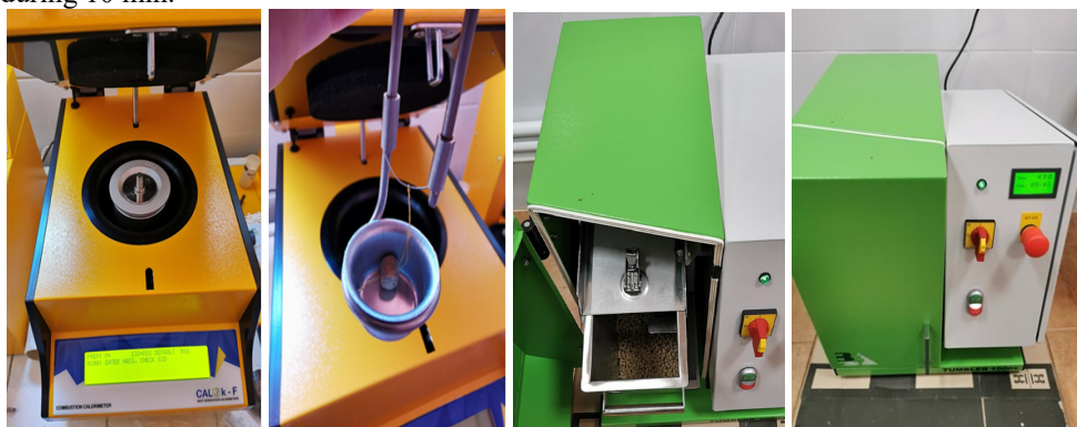
Fig. 3. Determination of calorific value and durability of feed pellets

The determination of the gross energy value of the feed pellets was performed with the help of a CAL 3K-F calorimetric system, and the durability of the pellets was calculated using a TUMBLER 1000 laboratory system and the method used was 500 complete rotations during 10 min.