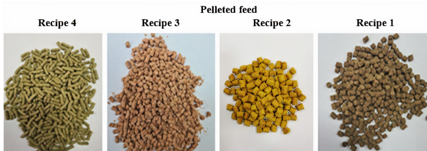
Fig.1. Pellets resulted from the four feed recipes for cyprinids

The paper studies four different recipes of pelleted feed for aquaculture, especially for the cyprinid family. Pelleting was performed using an experimental model installation model for obtaining granulated / pelleted feed for aquaculture. The main technical characteristics of the pelleting / granulating press are the following: supply voltage: 230 V, electric motor power: 2800 W, maximum speed: 1400 rpm, production capacity: 100 kg/h, die orifice diameter: 3-8 mm.