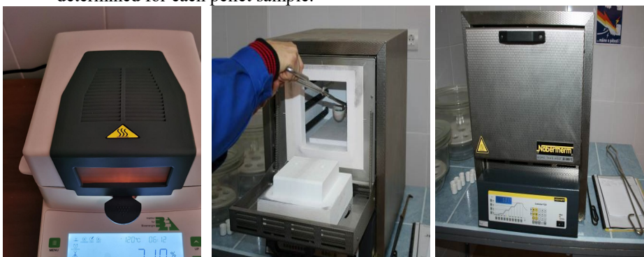
Fig. 2. Determining moisture and ash content

The determination of the gross energy value of the feed pellets was performed with the help of a CAL 3K-F calorimetric system, and the durability of the pellets was calculated using a TUMBLER 1000 laboratory system and the method used was 500 complete rotations during 10 min.