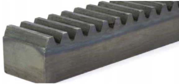
Fig. 1. Steering mechanism toothed bar [author's own study]