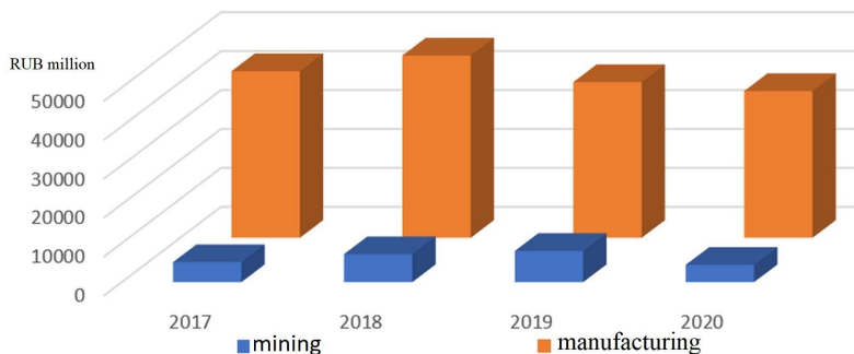
Fig. 2. Dynamics of investments in fixed assets of mining and processing industries in Russia.

The mining industry is capital intensive with a predominance of fixed assets in the property structure. Meanwhile, there is a downward trend in capital investment, which is largely a consequence of COVID-19 crisis. The dynamics of investments in fixed assets in actual current prices are shown in Fig. 2.