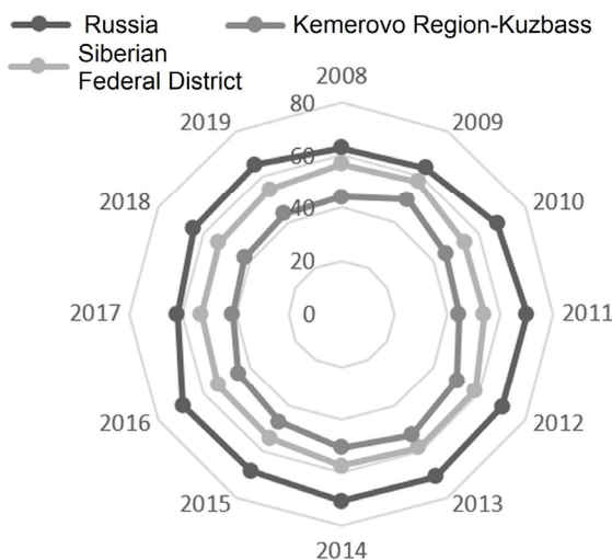
Fig. 2. Dynamics of the share of the service sector in the GDP of the Russian Federation and the GRP of Siberian Federal District and the Kemerovo region in 2008 – 2019, %.

A comparative characteristic of the service sector importance in the economy of the Russian Federation, Siberian Federal District and the Kemerovo region is shown in Figure 2.