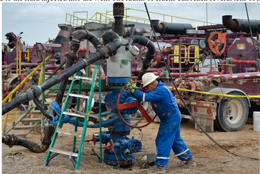
Fig. 1. Installation for hydraulic fracturing.

However, according to domestic ecologists [2-4], as well as foreign scientists [5, 6], one of the most harmful measures in oil and gas production is hydraulic fracturing technology. Hydraulic fracturing is a process that involves the introduction of a mixture of water, sand and chemicals into gas-bearing rocks under high pressure (500-1500 atm) (Fig. 1). This leads to the formation of small fractures, which improve the reservoir properties in the bottomhole zone, which leads to a significant increase in the well rate. All this system of fractures connects the well with the productive parts of the formation remote from the bottomhole. To prevent the closure of cracks after pressure reduction, coarse sand is introduced into them, added to the fluid injected into the well. The radius of cracks can reach several tens of meters.