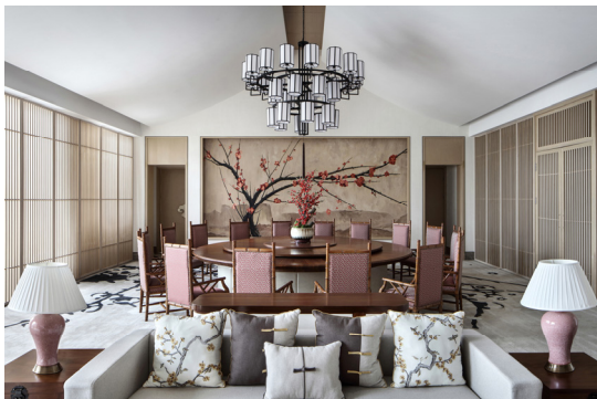
Figure 13. Real view of private room 1.