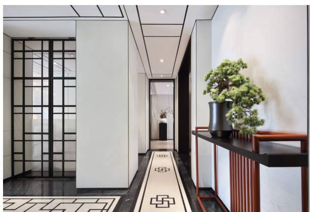
Figure 4. Real view of corridor 2.

The design of living room is mainly based on reduction, and every part of it is being deliberated, emphasizing the visual characteristics of the picture, which is closer to the style of Song people in terms of cultural roots.