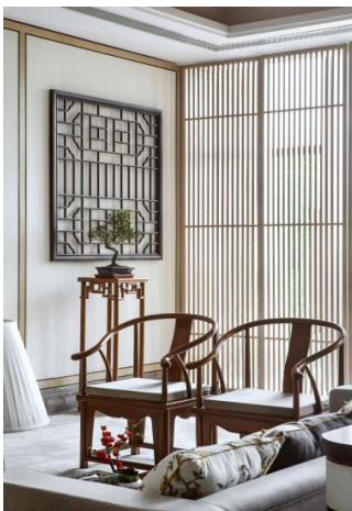
Figure 14. Real view of private room 2.

The design team adopts the original lattice window, plum blossom and other elements, and uses the log tone to create the Zen Oriental concept, "touch the scene to create feelings", and integrate into the quiet realm.