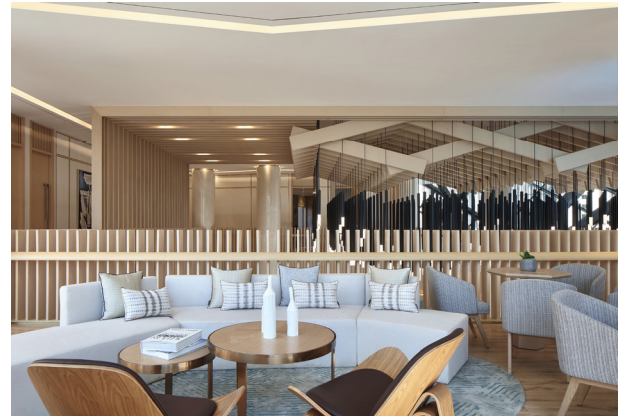
Figure 9. Real view of rest area.