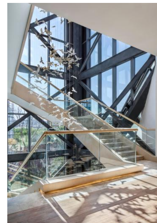
Figure 10. Real view of stairs.