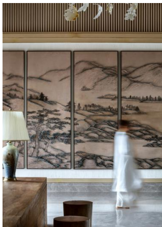
Figure 12. Real view of the hall 2.