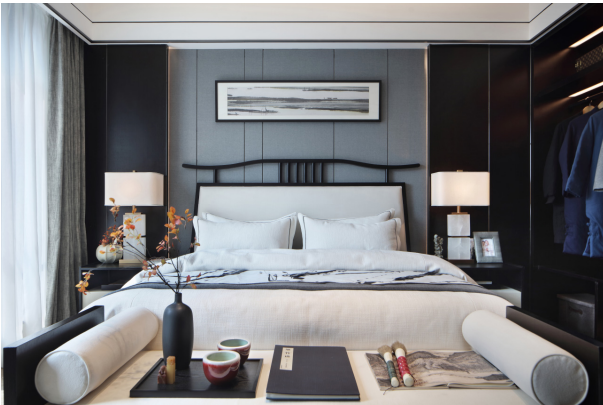
Figure 6. Real view of corridor 2.