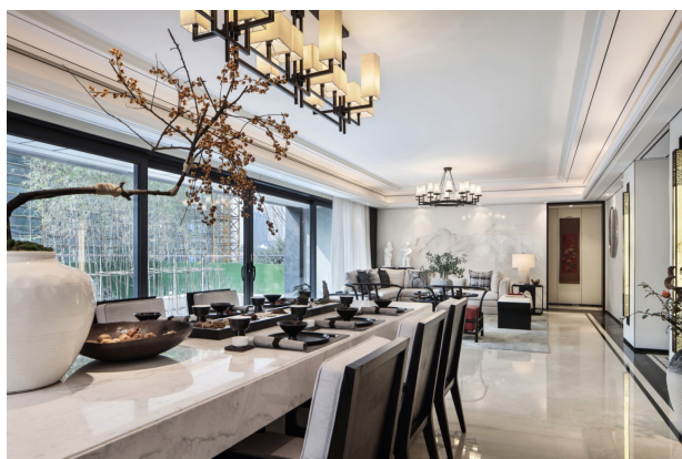
Figure 1. Real view of guest and restaurant.

In the design of guest restaurant and tea house, the style of mountain, the flexibility of water pattern, traditional Chinese carving and other elements are used to create a poetic ancient space.