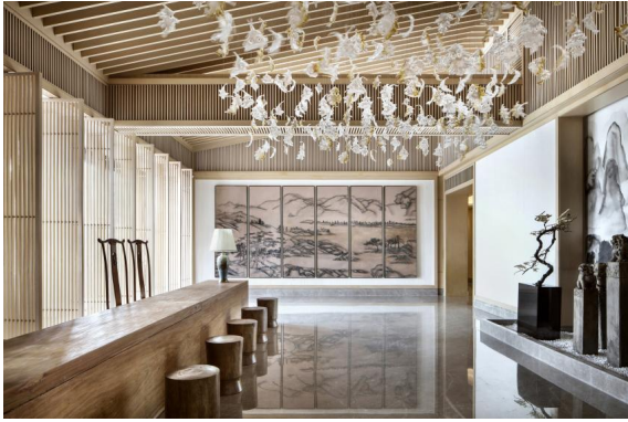
Figure 11. Real view of the hall 1.