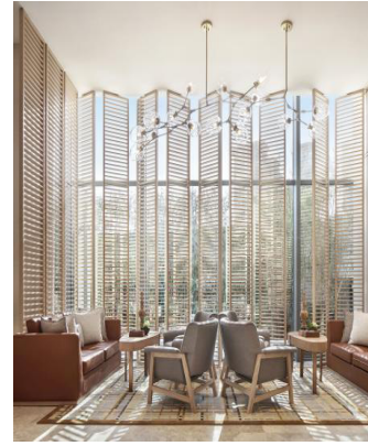
Figure 8. Real view of VIP negotiation area.