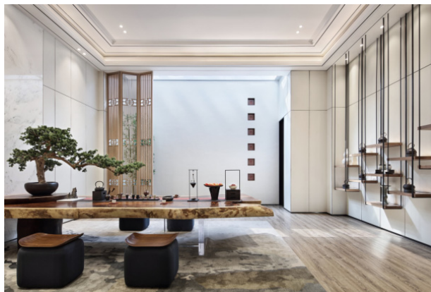
Figure 2. Real view of guest and restaurant.

"Thin stone logs together, graceful erecting does not change four spring". The corridor design adopts the combination of large area blank and traditional carving, one black and one white, giving the space elegant and pure spirituality.