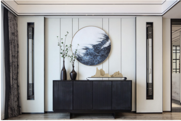
Figure 5. Real view of corridor 1.