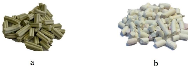
Fig. 3. Catalyst support forms of extrudates: a – modern catalysts, b- domestic catalysts.

According to the high quality of fine-grained complex-profile extrudates, the basis is pseudo-boehmite and boehmite aluminum hydroxides, which, in fact, are described in hydrodesulfurization catalysts patents [11,29].