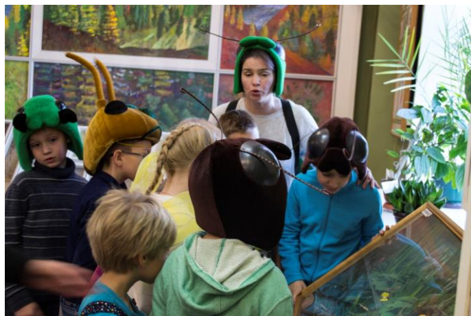
Fig.3. Excursion "One, two - I'm turning into an ant!"

Another live exhibit, the family of the garden black ant has settled behind the walls of the Museum - Lasius niger . A special excursion has been worked out for this purpose "One, two-I'm turning into an ant". Which has taken place in the parallel program of The Childish Days in Saint Petersburg for the first time. One could watch live ants and see their home with a help of a magnifying glass and observe the ants through a microscope during the travelling game. The game participants learn about different kinds of ants, about the life of the anthill, get familiar with their enemies and friends, about the role which ants play in the environment and their influence on the soil. Whether a human being is so different from ants and what people can learn from them. You may find the answer to this question during the game, trying on a part of a princess, a soldier, a spy, a nurse or a working ant. A board environmental game showing all the significance of "the little workers" for the Nature is awaiting children as the final part of the activity.