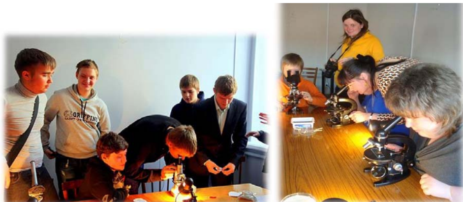
Fig. 2. A laboratory class called "Underground inhabitants under microscope"

During the class the visitors were making some temporal micro preparations and they were watching the microscopic soil organisms such as the infusoria - Paramecium caudstum , the amoeba - Amoeba proteus , the rotifers - Rotatoria , nematodes - Nematoda .