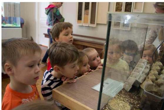
Fig. 1. Crickets ( Gryllus locorojo ).

On the Night of Museums live invertebrates were used for the first time. The visitors sitting by the diorama "Steppe", having closed their eyes, were listening to the chirping of the crickets and they momentarily found themselves transferred from nocturnal Saint Petersburg to the steppe. Since then, the crickets ( Gryllus locorojo ) have become constant participants of excursion programs designated for various actions, and were "interwoven" into many constant excursions of the Museum as well.