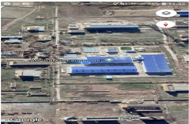
Fig.2. The schema location for the production of mineral fertilizer nitrogen-phosphorus-potassium (NPK) JSC “Samarkandkimyo”

these sources amount to 14.103351 tons / year. Analyses show that the volume of emissions of pollutants into the atmosphere does not exceed the permissible norm (MPC). Diagram of the location of the company JSC "Samarkandkimyo" is shown in fig. 2.