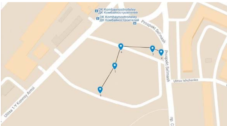
Fig. 1b. Map of the study area (The Ostrovsky Park in Rostov-on-Don) (made by the authors according to the data maps.google.ru)

The sample was represented by dark gray ice with organo-mineral material frozen in it at the station 2. At the stations 3-6, some samples were taken from a freshly fallen and decayed compacted, crystallized snow layer with a grayish hue and inclusions of organic and mineral mass (Fig. 2). The soil under that snow layer was not yet completely frozen, as a result, the transformation of leaf litter continued under the snow cover with the formation of carbon dioxide and related products of biodegradation of buried organic matter. There is a clear border between the newly fallen white loose snow and the stale snow (shown by the arrows) [5]. In total, during the expedition, the participants took samples at 7 stations at the same time.