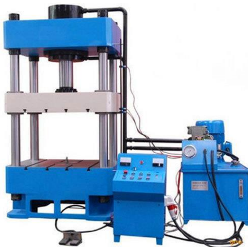
Fig. 2. Hydraulic press

The strength of aerated concrete samples for strength following the normative requirements of GOST 10180-2012 was determined using a hydraulic press (Figure 2).