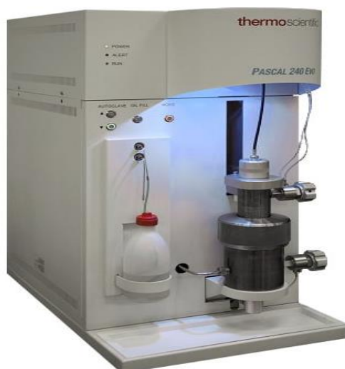
Fig.1. Thermo Scientific Pascal symbolic porosimeter

The study of the porous structure of aerated concrete blocks was performed using Thermo Scientific Pascal mercury porosimeter (Figure 1).