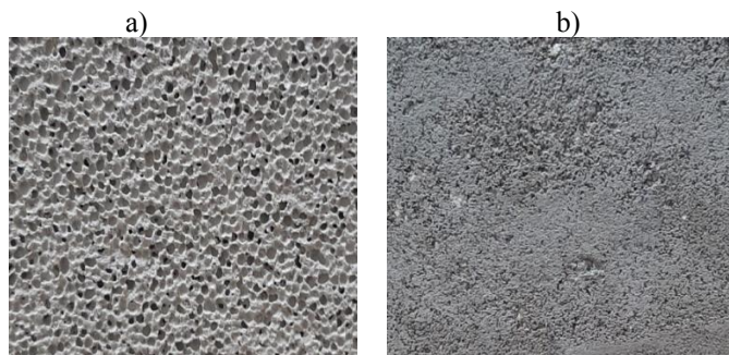
Fig.4. Photographs of surfaces of non-autoclaved aerated concrete samples D600 (a) and D900 (b)

The technology developed for the production of autoclaved aerated concrete was tested in the production organizations. For this purpose, the compositions D600 and D900 were mixed following the developed technology. The samples were determined according to the porosity properties according to the standard method developed (Figure 4) [21-28].