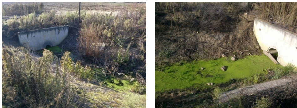
Fig. 1. Condition of the drainage canal and its facilities in long-term operation without current and capital repairs

The artificial operation conditions that have negative influence on the drainage canal operation include: non-compliance with technical requirements during the engineering and construction of hydro-reclamation systems; steep slopes; disturbed canal bottom slope. Significant adverse impact on drainage canals is made by non-compliance with technical documentation of the system by business companies in general; crossing over the canals by tractors and other agricultural machinery; clogging of the canal with stones, weeds and garbage (Fig. 1).