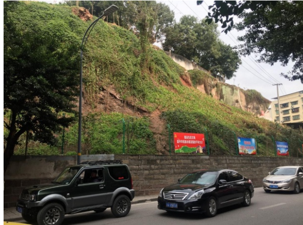
Fig. 1. Mountain damage status

According to field investigations, there are two main problems in mountainous cities: water quality and shoreline. Because the water body is in a closed state, the renewal cycle is long and the self-purification ability is low, and Chongqing is a subtropical monsoon humid climate, it is very easy to breed algae and appear "water bloom" phenomenon. In addition, the urban water bodies