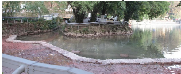
Fig. 2. Water damage status

are surrounded by various types of urban construction land. The surface runoff formed by rainwater during rainfall washes the surrounding buildings and roads, and brings various pollutants on the ground into the waters, directly or indirectly causing water pollution. The main pollutants are organic matter and nutrients from grassland and nursery.