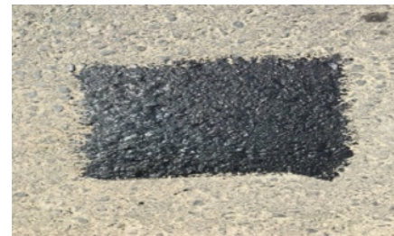
Figure 1. Thermal reflection coating of emulsified asphalt mixed with nano \text{TiO}_2

3) Select 4 pieces of 30\text{cm} \times 30\text{cm} area, and ensure that the 4 pieces are completely exposed to the sun. Sprays nano-modified emulsified asphalt thermal reflection coating with different mixing amount in the 4 pieces and pay attention to keep the spraying uniform and the sprayed thermal reflection coating should completely cover the asphalt surface, as shown in Figure 1.