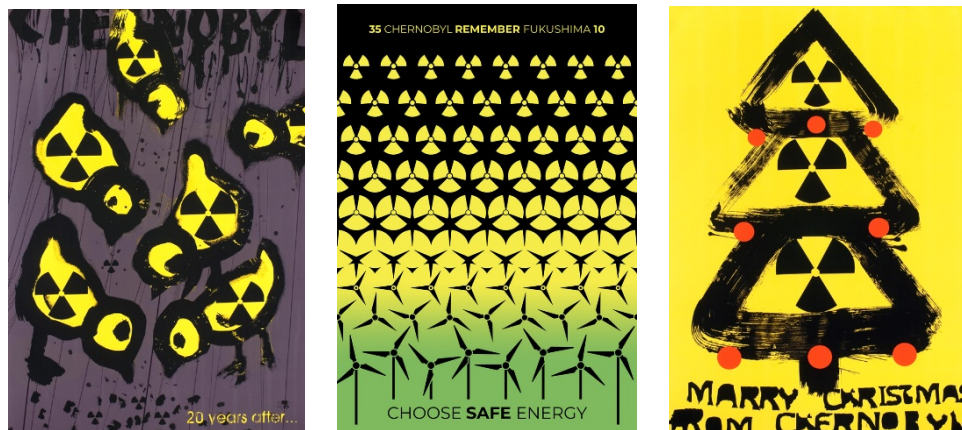
Fig. 4. 4 th Block posters, 2006–2021

of the world community to environmental problems, the consequences of social, man-made and natural disasters (Fig. 4). The Ukrainian Association of Graphic Designers aims to unite efforts to help solve environmental problems through poster art, education of environmental awareness. Due to this, the association has achieved wide international recognition. The “4 th Block” is not an elite creative forum closed to self-sufficient formal searches. It has a special social orientation, close and understandable to everyone and attracts more and more participants from different countries and continents.