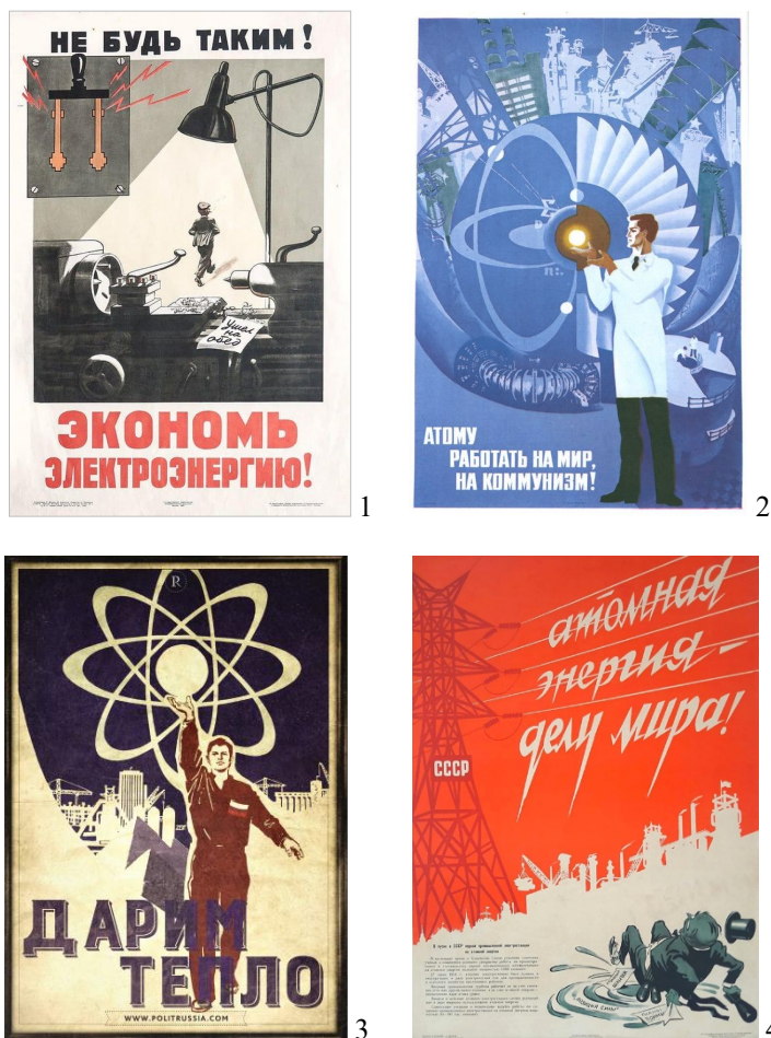
Fig. 2. Soviet posters, 1980s: 1. Don't Be Like That! Save Electricity! 2. Atom to work for Peace, for Communism! 3. We give warmth 4. Nuclear energy for the cause of Peace!