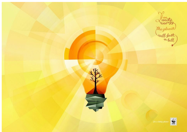
Fig. 1. WWF, the World Wildlife Fund energy-saving poster, 2016 [19]

The famous Swiss graphic designer Mueller-Brockmann believed that the poster is the most effective means of visual communication, it should stimulate, explain, provoke, persuade. Its form should be easy and accessible, however, to achieve this is much more difficult than to express oneself the artist in the painting [18].