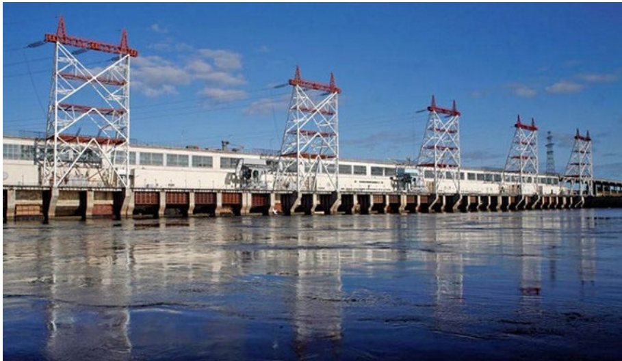
Fig.1. Cheboksary Dam on Volga river in Russia

In the Figure 1 that follows, one can see the photo of the Cheboksary Dam on Volga river which is a part of the Volga-Kama Cascade and the only hydro power station in the world that has a highway built over its roof. The dam is a local tourist attraction visited by thousands of people every year [11].