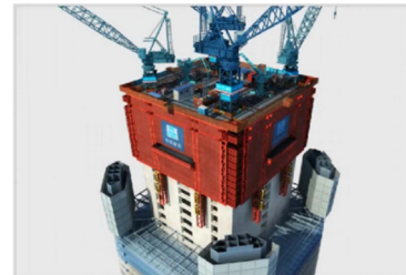
Fig. 2. Integrated Platform 3D Model

The integrated platform not only has the advantage of previous generations but has also been made some modifications and innovations. The integrated platform is the first system which the construction tower is integrated into platform and realizes synchronous lifting. In this project, the integrated platform integrated three tower cranes (ZSL2700/M1280D/ZSL1150) [7] .