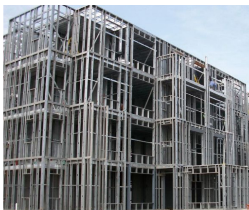
Fig. 1. Cold-formed thin-walled steel structure residence

Compared with ordinary hot-rolled section steel, the processing of cold-formed thin-walled steel is more simple, fast and efficient, so it is widely used in villas, multi-storey residential buildings and light steel plants [1] , as shown in Fig.1. The steel can be completely recycled to meet the requirements of environmental protection and sustainable development.