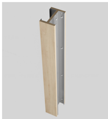
Fig. 3. Cold-formed thin-walled steel-timber composite column

At present, the widely used cold-formed thin-walled steel housing structure system is a "box" structure [7] , which is composed of composite wallboard, floor and roof truss. The horizontal load of this structure is borne by the shear wall, and the vertical load is borne by the columns in the bearing wall. The "box" type cold-formed thin-walled steel housing structure system is a non frame structure with relatively low bearing capacity, and the section type of bearing members is too single to meet the use requirements of multi-storey and high-rise buildings. In order to improve the bearing capacity and seismic performance of cold-formed thin-walled steel frame structure, the beam column with steel wood composite section is used as the main load-bearing member, and the board is used to restrain the overall instability and local buckling of cold-formed thin-walled steel. The cold-formed thin-walled steel-timber composite section member is assembled by cold-formed thin-walled steel members by adding wood plates and adopting bolt connection, as shown in Fig.3.