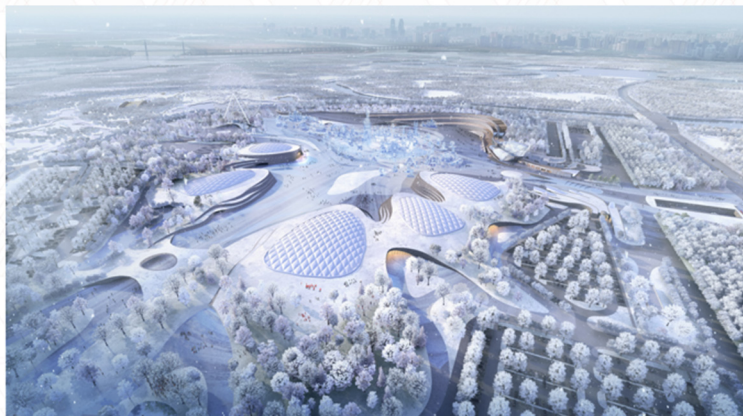
Figure 1. Architectural renderings.

The total land area of the project is about 87 hectares, and the total construction area is 96,000 square meters. The main functions are composed of outdoor parks and indoor venues. The outdoor park is composed of ice construction and ice sculpture exhibition area, ice slide area, ice rink recreation area, non-powered recreation area, ferris wheel and other functions. Indoor venues include: Iceberg Pavilion, Dream Ice and Snow Pavilion, Ice and Snow Show, Ice and Snow Art Museum, Comprehensive Museum, Ticket Office at the main and secondary entrances as well as related supporting facilities. This paper analyzes the basic form and layout of the ice and snow show.