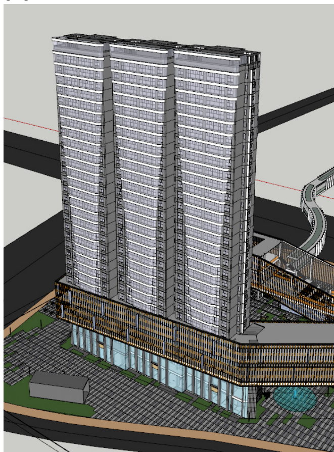
Figure 1. Architectural renderings.

Qianjin West Road to the north, Louchuang Road to the south and Sichang Road to the east. Zu Chong Road to the west. The project includes one office tower, four residential towers and one commercial tower. Each unit shares the basement, which has three floors in total. This design is 4# super high-rise residential building and corresponding basement.