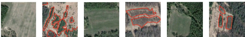
Fig. 2. Several images fragments as of 2009 and 2020 with detected overgrowth fallow by the 4th level wavelet decomposition

The final stage of the technique of operational detection of unused land plots (fallow lands) subject to overgrowth by tree and shrub vegetation based on satellite images based on wavelet transformation is changes automatic vectorization in the images (Fig. 2).