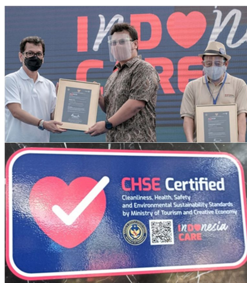
Fig. 1. The Implementation of CHSE in Bintan Regency.

The implementation of the Health Protocol and CHSE certification goes well because humans need to stay alive. The implementation of CHSE and the Health Protocol received a positive response based on the respondents' results. In addition, the Government in this case assists in the form of providing the tools of Health Protocol, implementing certification, and the implementing of vaccines is welcomed. Some expectations from respondents are the implementation of the vaccine will be accomplished immediately for all groups not only for tourism employees thus tourists feel safe when doing tourism activities. The CHSE certification is expected to build the confidence of potential tourists by knowing that the locations visited have followed the CHSE standards implemented by the Government.