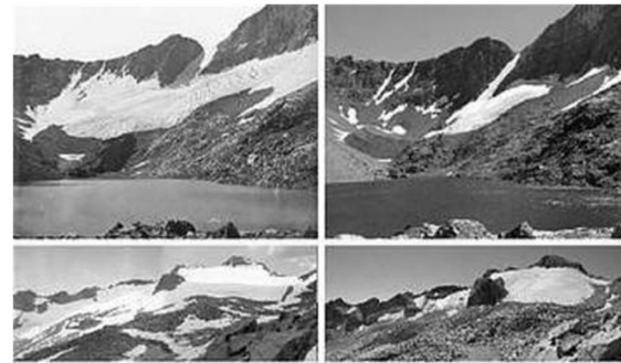
Figure 2. Photograph of Sierra Nevada glaciers in 2005 (MacDonald, 2007)

and more serious drought, and that is a potential hazard in California.