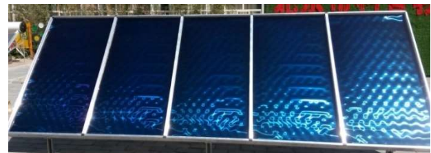
Fig.1 High efficiency large flat plate collector

the unit effective heat collection area is small, the heat gain is low, and it needs to occupy more building space. Therefore, the high-efficiency large flat plate collector is selected for the heating system in this paper, as shown in Figure 1. The basic size is 5920mm×2224mm×130mm. The antifreeze heat transfer medium is used to collect heat. Under the irradiation of sunlight, the light energy is converted into heat energy, and then the heat is transferred to the cold water through the plate heat exchanger to gradually increase the temperature of the cold water.