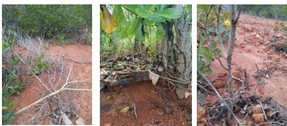
Figure 2. Mangroves condition at Sungai Karang and Senggarang which left picture is broken of stems; the middle picture is the change of leaves color and the right picture is the dead of roots.

The cause is thought to be due to the activities of local residents entering the mangrove forest area, winds that are too strong, or weathering. In addition, the condition of damaged leaves was found as much as 20% and leaves that changed color as much as 14%. Symptoms that can be seen are leaf chlorosis (lack of green matter) such as turning yellow or brown, brown or black spots, and withered leaves [5]. stated that the symptoms of leaf damage can be caused by the absence of chlorophyll formation due to the presence of pathogens, toxins, excess chemicals, or burning by temperatures that are too high.