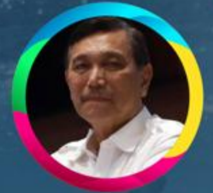
Luhut B. Pandjaitan Minister of Coordinating Ministry of Maritime and Investment Indonesia

Sept, 23-26 th 2021 | Bintan Island, Indonesia