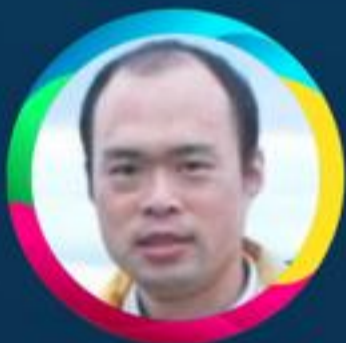
Xuelel Zhan First Institute of Oceanography, China