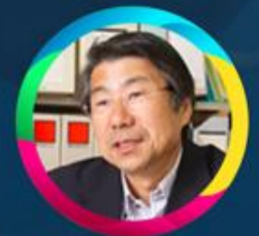
Tamiji Yamamoto Center for Restoration of Basin Ecosystem and Environment Japan